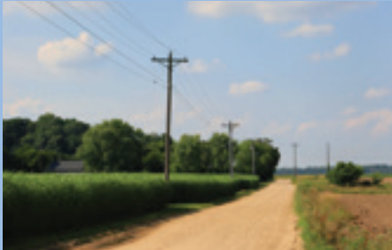
Impacts of Rural Broadband Page 16