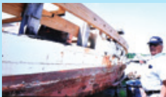
Built in 1949, The City of Crisfield began a full restoration in early 2021