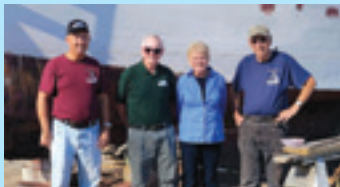
Part of the restoration team